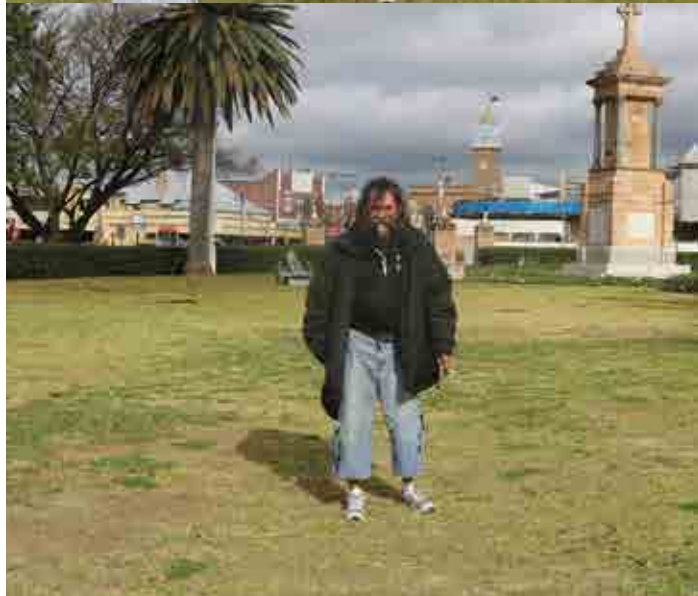
Having a rest stop at Warrick