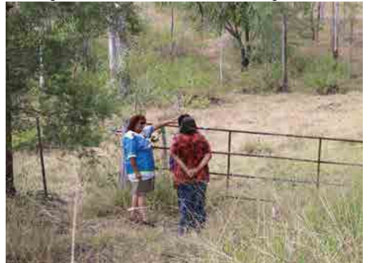
Deebling Creek Mission