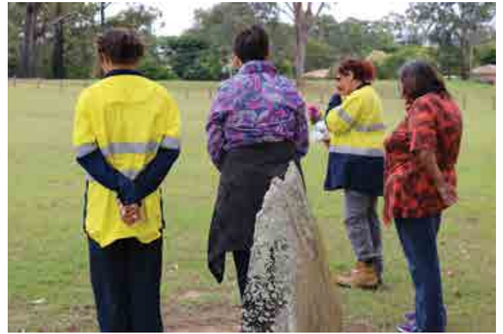
Paying our respects at Beaudesert Cemetery