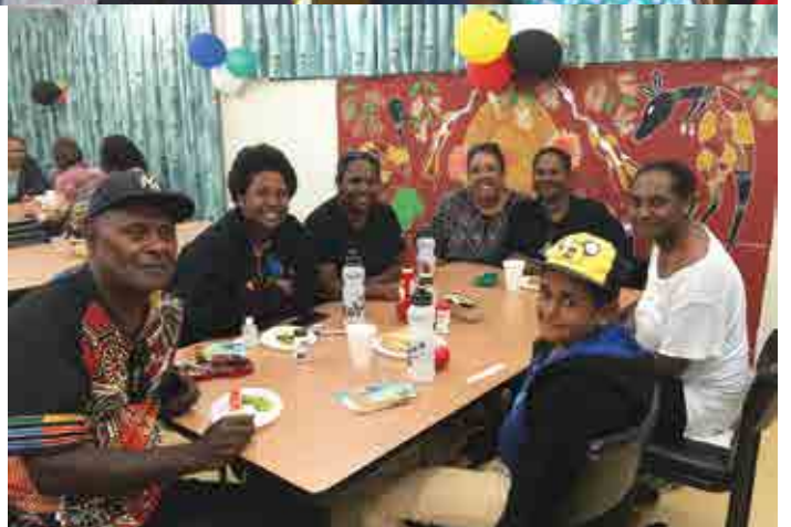
NAIDOC Lunch at Iris Clay Hostel in Townsville