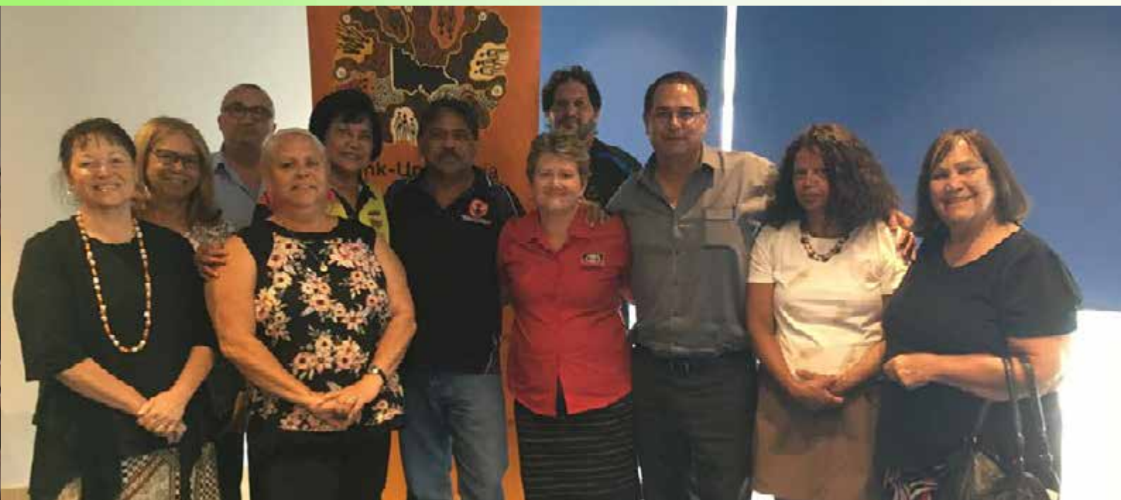
Members of the National Link Up Leadership Group Network meeting in Melbourne, March 2017

As we start to count down the weeks before the end of another busy year it is timely for a bit of reflection about our past work and to start thinking about plans for our future work. For us in Victoria there have been a number of highlights that have provided us with the evidence that we are making a difference to the Stolen Generations and their families. For Link-Up Victoria It is also important that we continue to strongly advocate for the needs of the Stolen Generations in whatever way we can and ensure that their changing needs and aspirations are met.