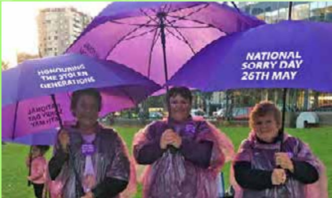
Caption: National Sorry Day – Guests enjoying the peaceful surroundings of Parliament Gardens, Melbourne