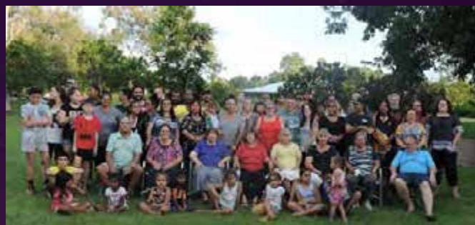
Reunion held in Darwin that NTSGAC supported with VACCA and SA Link Up's.

In January 2017 a family reunion was held in Darwin, 3 Link-up services were involved in reuniting family members of a person who had been adopted some 40+ years ago. Unfortunately his birth mother had passed but he was able to meet up with 2 of his siblings, 5 Aunties and many cousins. The Aunties who played a huge part in the reunion were able to fill in the blanks about his Mother and family background by sitting around talking and showing photos. Several activities were carried out over the 4 days and enjoyable time was had by all.