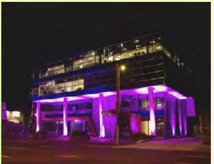
A splash of purple lights up Melbourne City on the night of National Sorry Day