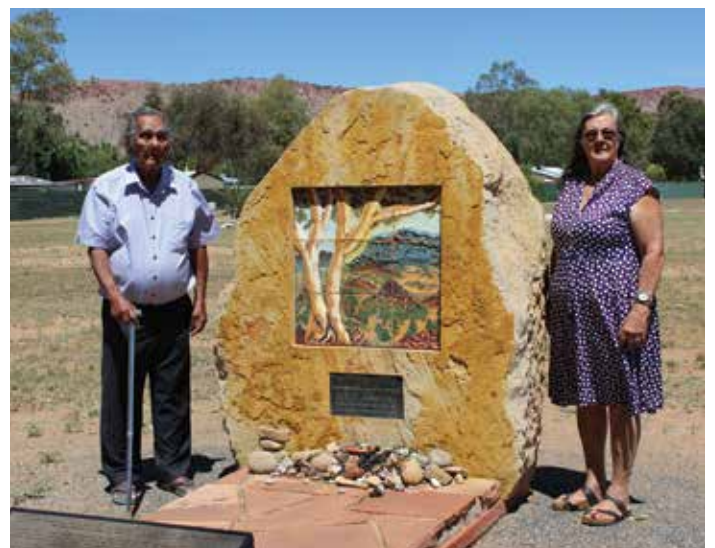
Visiting Albert Namajira's gravesite in Alice Springs