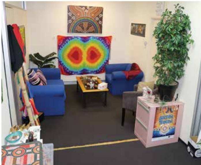
Link-Up (Qld) Brisbane's Healing Room

We wish you all a very merry Christmas and a Happy New Year.