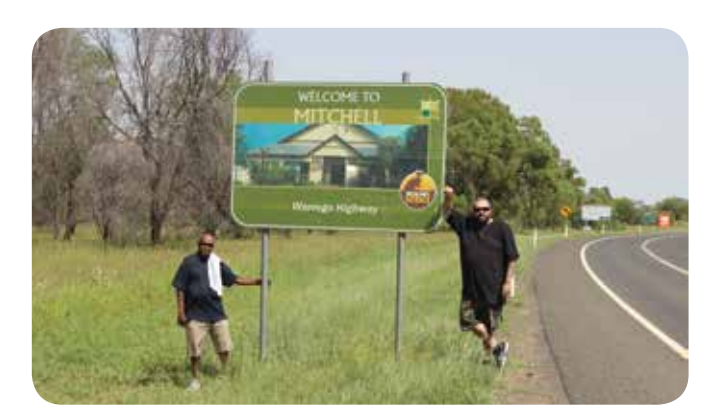
Driving in to Mitchell

are home". A peace fell over me as I stood there besides the grave, I was speechless. I lay my hands on the dirt and asked God "to take him home". I knew then that the dream had been fulfilled.