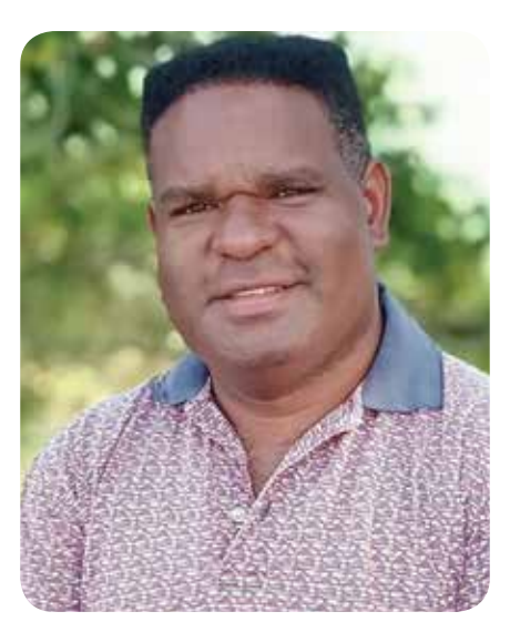
Phillemon Mosby, Mayor of the Torres Strait Island Regional Council

www.facebook.com/ HopeValeAboriginalShireCouncil