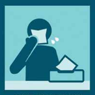
COVER COUGHS AND SNEEZES