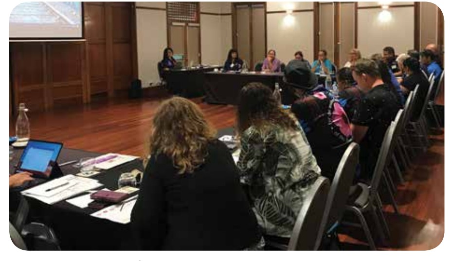
One of the many presentations over the two days

Thursday afternoon the group visited the traditional owners at the Yawuru office and were treated to some cultural history and a wonderful afternoon tea.