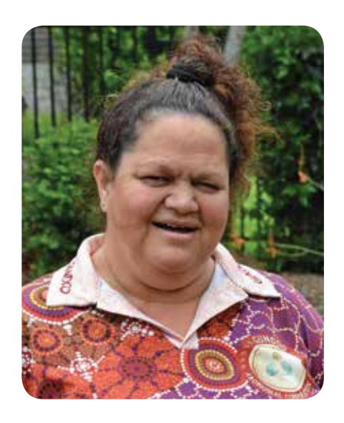
Cherbourg Mayor Elvie Sandow

Elvie Sandow will be sworn in as the new Mayor of Cherbourg Aboriginal Shire Council.