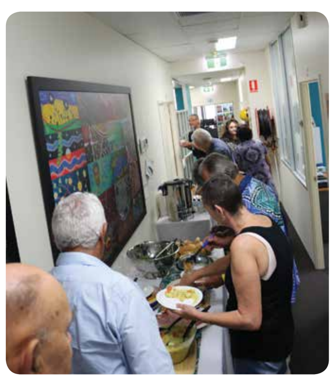
Staff prepared another hearty lunch that was very well recieved by the attendees