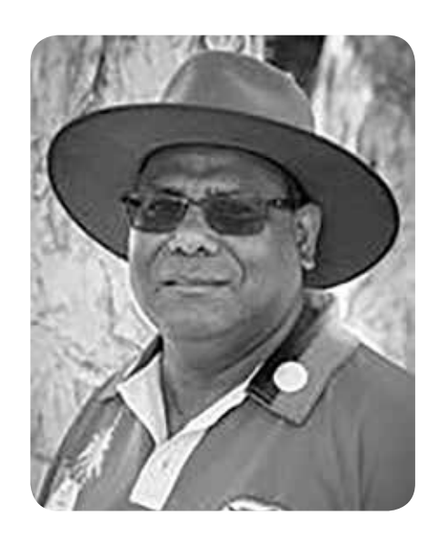
Ross Andrews, Mayor of Yarrabah Aboriginal Shire Council