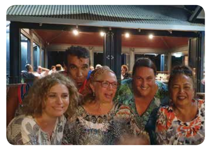
Enjoying dinner at Cable Beach Resort Restaurant