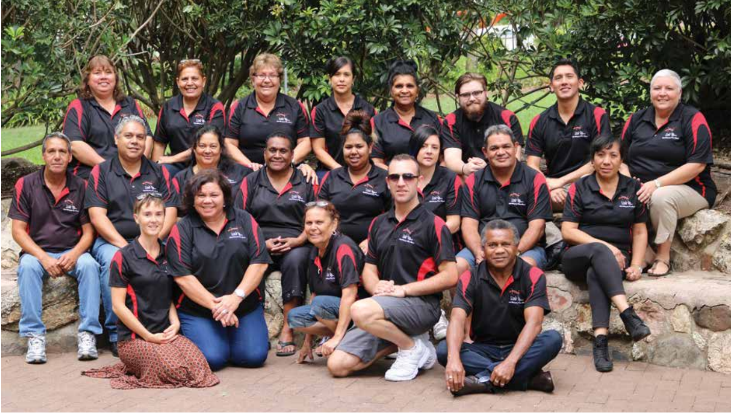
Link-Up (Qld) Staff at Cedar Creek Lodge

Last month Link-Up (Qld) staff attended our staff planning retreat at Cedar Creek Lodges at Mt Tamborine. It was a good chance for us to relax a little, away from the office and get to know each other better through some team building activities.